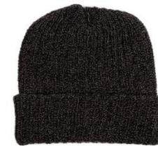
Woollen Hat especially in Winters