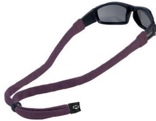
Sunglass with chums (optional)