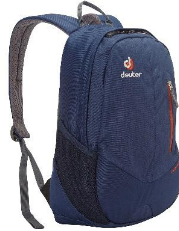
Day Pack( 20 -30 ltrs) Please do not carry any Suitcases