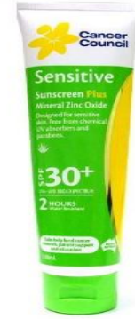
Waterproof Sun screen