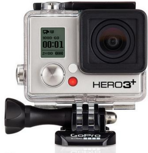
Go Pro or Action Cams