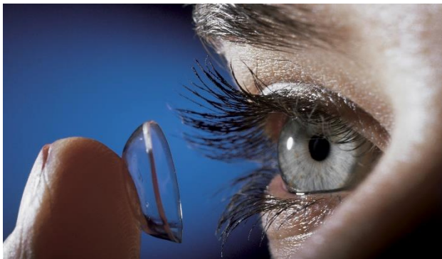
Contact Lenses/ Glasses