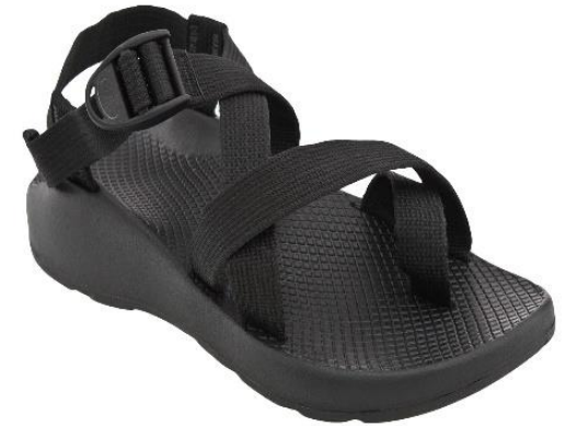
Chacos or Sandals with high quality straps