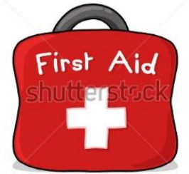
Personal First Aid Kit with Personal Medications