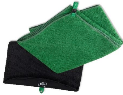
Quick Dry Towel