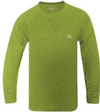
T shirts or Shirts