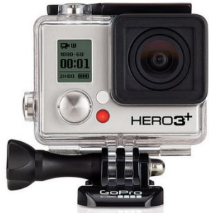
Go Pro or Action Cams