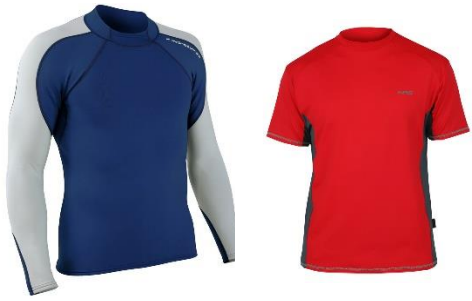
Quick dry t-shirts full or half sleeves (Lycra or polyester) (avoid Cotton)