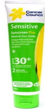
Waterproof Sun screen