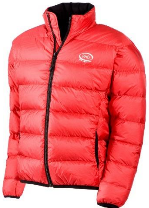
Light weight Jacket especially in Winters