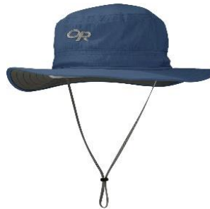
Wide brimmed hat or Sun Hat