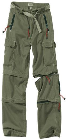
Light weight Trousers