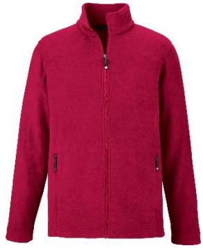
Fleece or Sweat Shirt