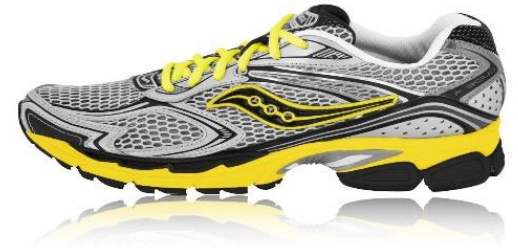
Trainers with socks