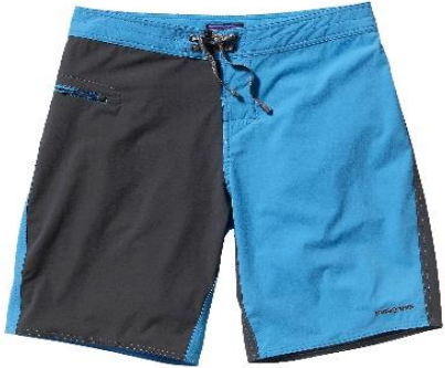
Quick Dry Shorts (Avoid Cotton)